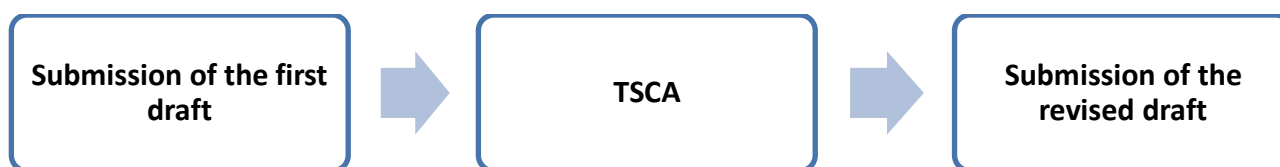
Figure 1. A TSCA cycle in the first semester