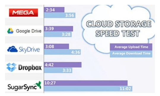
Figure 1.2 Cloud Storage Speed

SkyDrive, DropBox, and SugarSync found results data stored in cloud storage. that can be seen in figure 1.2