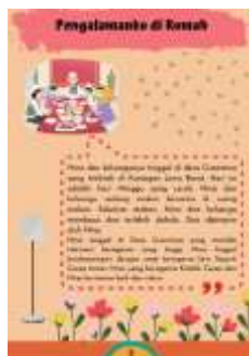
Figure 3. Materials Packaged in the Form of Stories