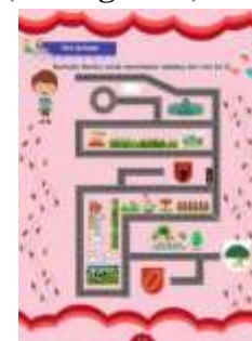
Figure 5. Games contained in the Smart Kids Worksheet