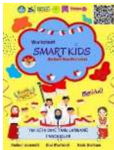
Figure 2. Smart Kids Worksheet Cover