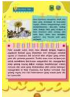
Figure 6. Information on Local Wisdom of Cisantana Village