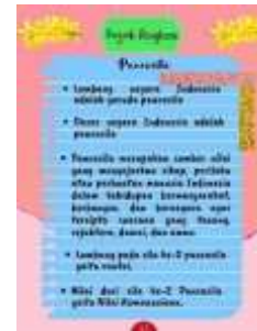
Figure 4. Summary/Summary of Material

remembering the contents of the smart kids worksheet teaching materials. This summary is packaged in a colorful and concise form (see Figure 4 ).