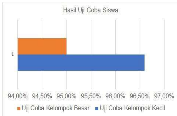
Figure 7. Test Results

Based on the table above, the results of the small group trial questionnaire as a whole are 96.6% with a high practicality category, and the large group trial gets an average score of 95%.