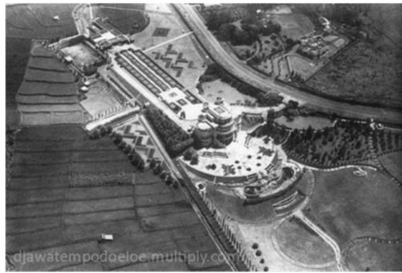
Figure 2. Villa Isola before Indonesia's independence

After Indonesian independence, the Isola villa was renovated by adding another floor above the roof, and the name changed to Bumi Siliwangi (Suprpto, 2019).