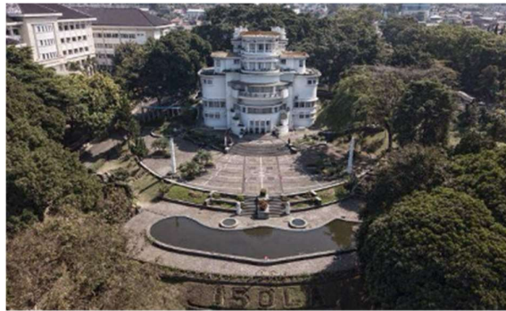
Figure 3. Villa Isola now

After Indonesian independence, the Isola villa was renovated by adding another floor above the roof, and the name changed to Bumi Siliwangi (Suprpto, 2019).