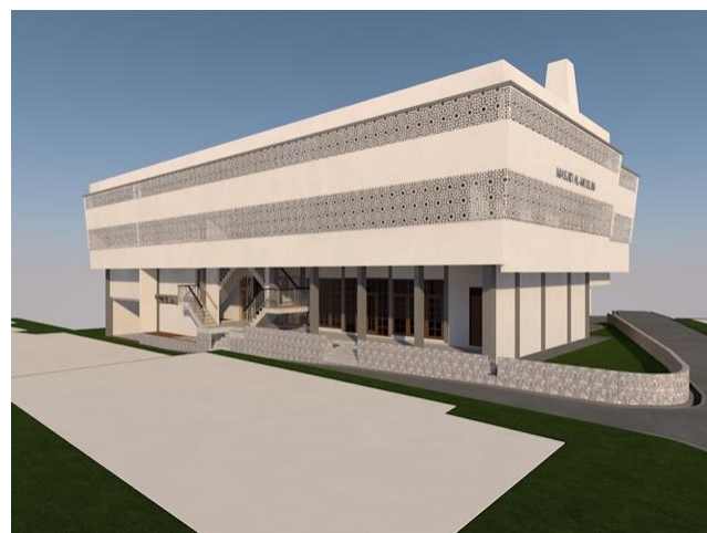
Figure 6. Final Appearance of the Mosque

A brief description of all the drawing process for renovation work either it was using 2D CAD or using BIM can be seen in Table 1.