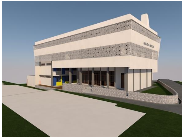
Figure 3. Existing Condition of the Mosque

The existing condition in 3D model is also important for public orientation. As seen in Fig. 3, the angel of the camera has chosen base on majority users when they came to the mosque. The demolition plan, see in Fig. 4, then presents with highlighting which part of the building that to be demolish with yellow color. It will show only with changing object classification properties from 'existing' to 'to be demolished' and follow with renovation filter by choosing 'Demolition Plan'.