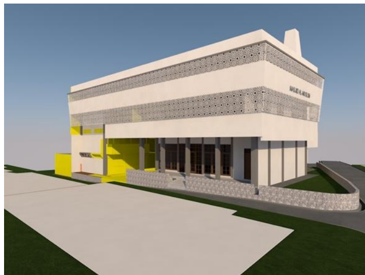
Figure 4. Demolition Plan (Highlighted with Yellow)

The new construction to be applied is shown in Fig. 5 with a red mark. The same way with showing demolition plan, the new construction plan will show with changing object classification properties from 'existing' to 'new' and follow with renovation filter by choosing 'New Construction'. Finally, all of the final appearance of the building after renovation in Fig. 6 will show by changing to 'Planned Status'.