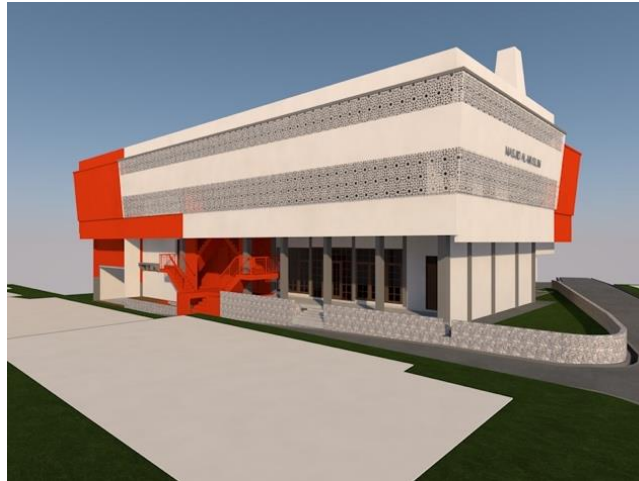
Figure 5. New Construction (Mark with Red Color)