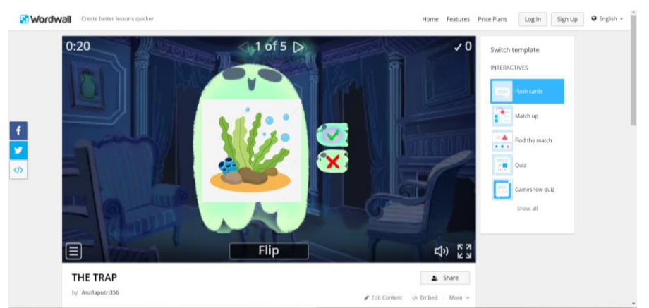
Figure 2. Wordwall: The Trap (Flip)

Another group of pre-service teachers used an anagram template with the ocean animals theme. In this template, students must arrange the random letters in the vocabulary to match the picture. As shown in Figure 3, the image shown was a turtle and random letters consisting of "l, r, t, e, t, u." Students must arrange the letters according to the English word " turtle ". Teacher candidates were also set up for the leaderboard in this game. Therefore, students with higher scores with shorter composing time would be ranked first. Wordwal.net would display the correct "checklist" marked instead of the letter (Figure 4). Meanwhile, if the student arranged the letters incorrectly, the word wall media would display a "cross" (Figure 5).