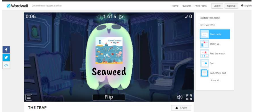
Figure 1. Wordwall: The Trap

As shown in Figure 1 and 2, the learning material which was designed by the pre-service teachers is flashcards of pictures and words about "sea creatures". The flashcards can be flipped by clicking the cursor. The flashcards is used in matching game which allows students to match the pictures with the words. Should the pictures match with the words, the students need to click \checkmark . Meanwhile, when the pictures do not match with the words, students need to click X.