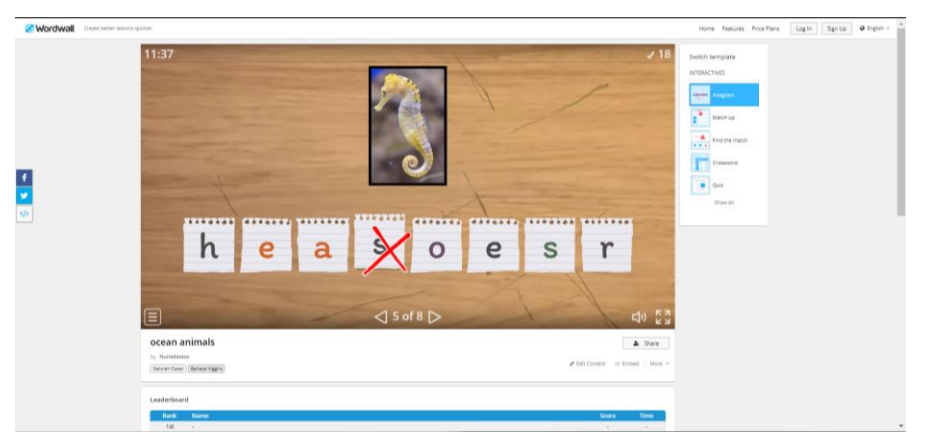
Figure 5. Ocean Animals Anagram (Incorrect)