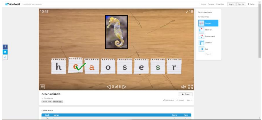
Figure 4. Ocean Animals Anagram (Correct)