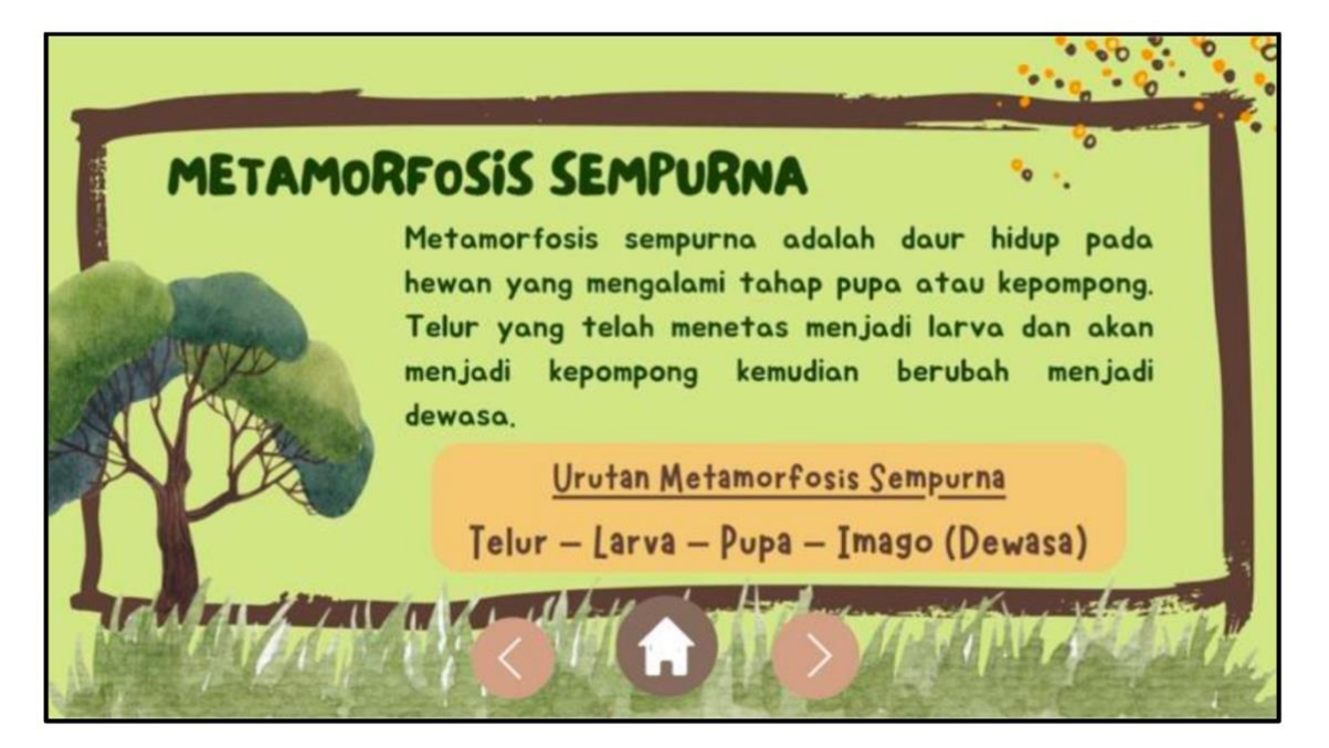
Figure 5. Perfect metamorphosis display.

From the perfect metamorphosis display, when the next button is clicked, the display will change to the camera view to scan images of examples of animals that experience perfect metamorphosis in the form of augmented reality (Figure 6).