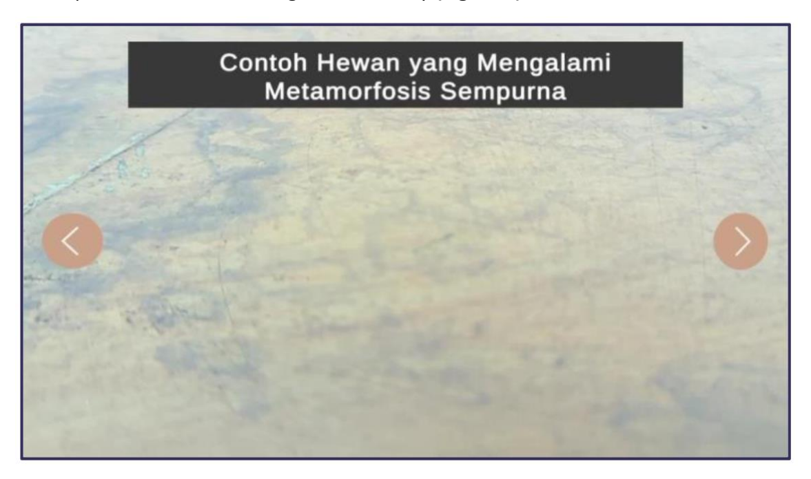
Figure 6. Scanned image examples of animals experiencing a perfect metamorphosis display.

From the perfect metamorphosis display, when the next button is clicked, the display will change to the camera view to scan images of examples of animals that experience perfect metamorphosis in the form of augmented reality (Figure 6).