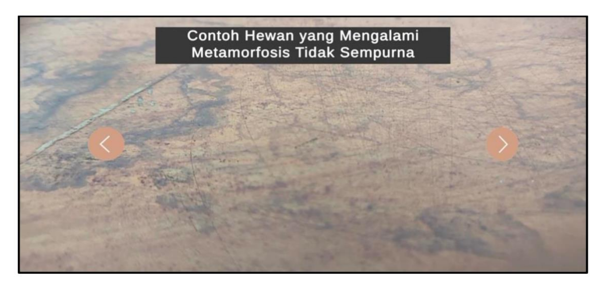
Figure 9. Scanned image examples of animals experiencing an imperfect metamorphosis display.

From the imperfect metamorphosis camera scan view, the user can change to the following view by clicking the next button. The following display is an example of an animal life cycle that undergoes an imperfect metamorphosis. From the main menu, this view can also be accessed if the example of the imperfect metamorphosis button is clicked (Figure 10) .