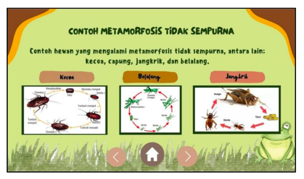
Figure 10. Example of imperfect metamorphosis display.

From the imperfect metamorphosis camera scan view, the user can change to the following view by clicking the next button. The following display is an example of an animal life cycle that undergoes an imperfect metamorphosis. From the main menu, this view can also be accessed if the example of the imperfect metamorphosis button is clicked (Figure 10) .