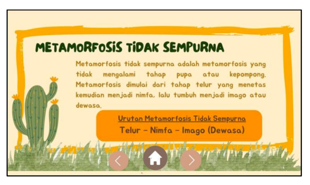
Figure 8. Imperfect metamorphosis display.

When the next button in Figure 7 is clicked, the display will change to the imperfect metamorphosis display, which contains an explanation of imperfect metamorphosis and the animal's life cycle. The imperfect metamorphosis display can also be accessed by clicking the imperfect metamorphosis button on the main menu ( Figure 8 ).