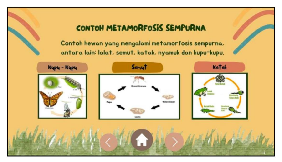
Figure 7. Example of perfect metamorphosis display.

131 | Journal of Software Engineering, Information and Communication Technology (SEICT), Volume 3 Issue 2, December 2022 Pages 123-136