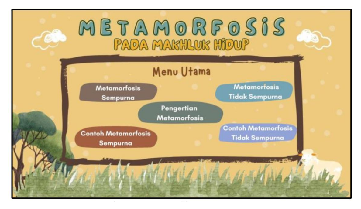
Figure 3. Main menu.

129 Journal of Software Engineering, Information and Communication Technology (SEICT), Volume 3 Issue 2, December 2022 Pages 123-136