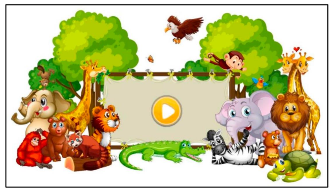
Figure 2. Application initial view.

The results of making learning media as augmented reality applications using Unity are as follows. In the initial appearance of the application, a play button is used to start the application. When this application is opened, the user will immediately hear music (back sound) (Figure 2).