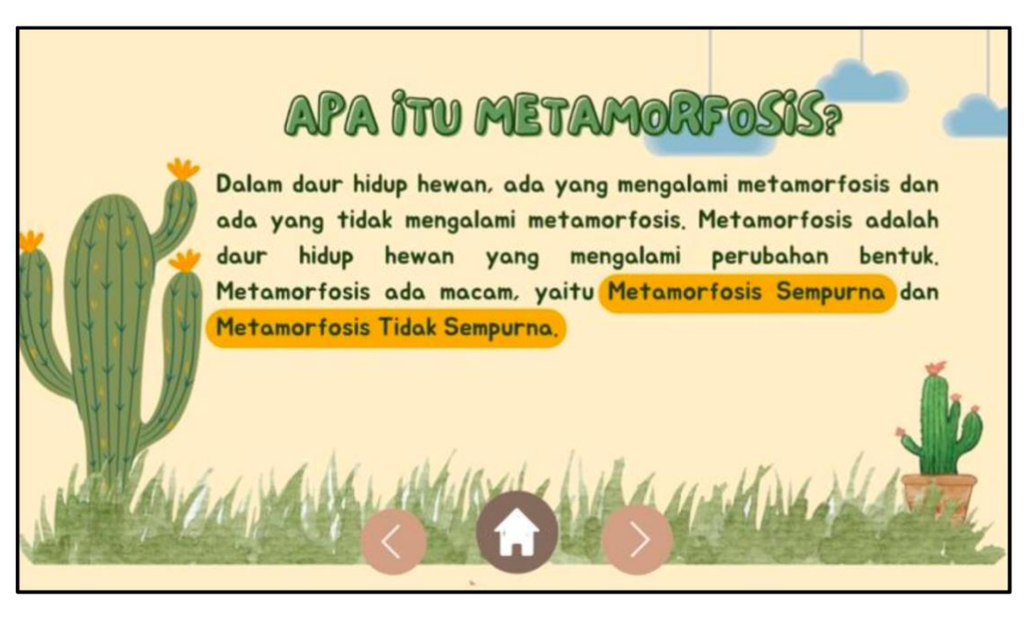
Figure 4. Understanding metamorphosis display.

When the definition of metamorphosis button is clicked, the display will change to an explanation of metamorphosis. In this view, there is also a back button to return to the previous display, a next button to go to the next display, and a home button to return to the main menu (Figure 4).