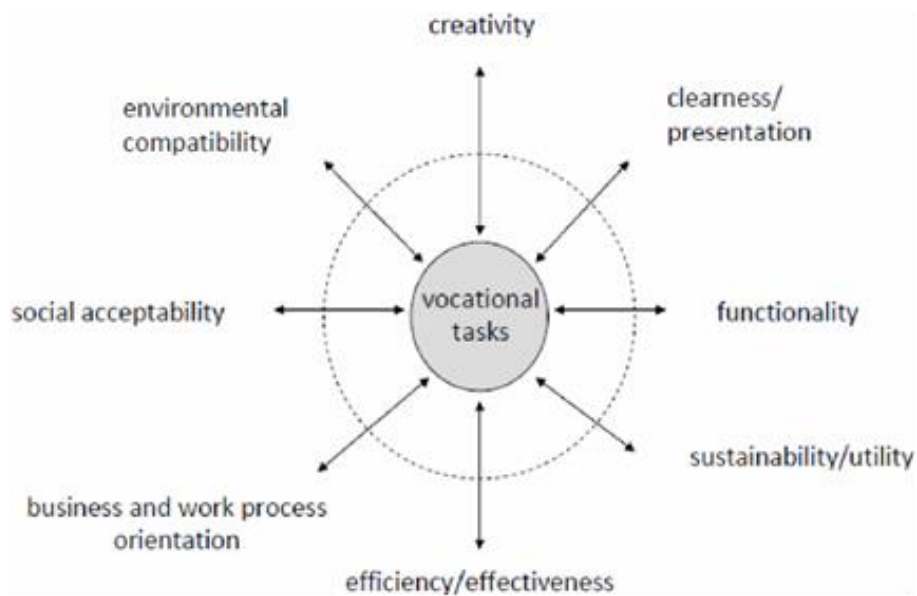
Figure 1: Attributes of the holistic (complete) solution of occupational / professional task to high quality standard.

The attributes outline in fig below represent eight-dimensions which skilled workers have to match up to in undertaking a work task (INAP commission 2012).