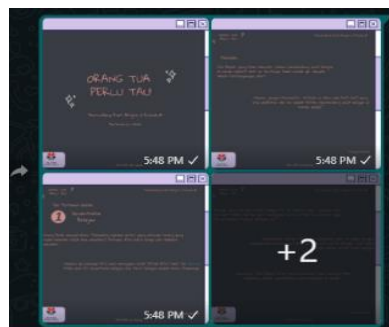
Figure 1. Material Tips for Guiding Children with Special Needs Studying at Home #1

With the changing times that are increasingly changing and developing, it is also very demanding for parents to learn. Learning to be able to educate children in accordance with increasingly severe challenges due to the increasingly complex changes that occur. With these changes, the need for learning will continue to grow, with broader concepts and forms of learning (Hairani, 2018). The development of technology also greatly facilitates parents to continue learning wherever and whenever, so there is no reason not to learn.