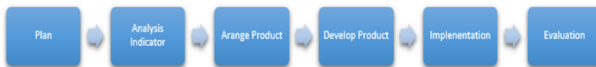
Figure 1. Schematic diagram of the research procedure.

Figure 1 shows study focuses on motor skills in improving self-development ability to wear and fold clothes in children with a student with intellectual disabilities. The research flow carried out includes :