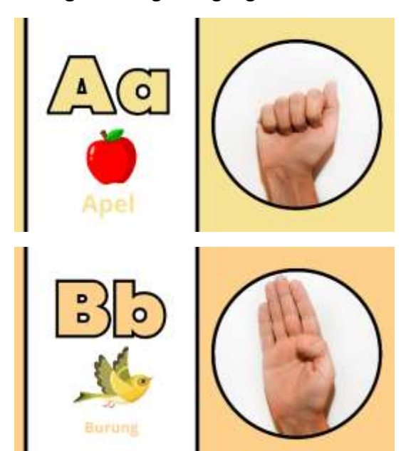
Figure 2. Sign Language Flashcard